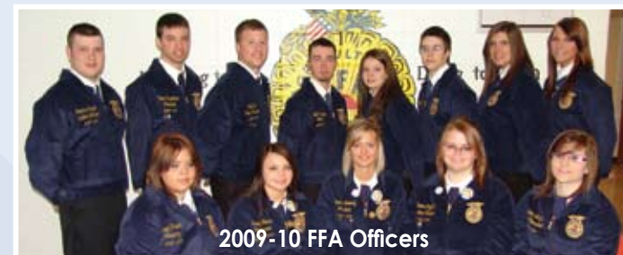
2009-10 FFA Officers